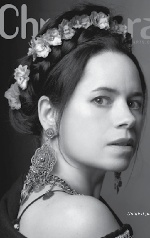
Untitled photo of Natalie Merchant Chronogram Cover February 2010 Issue